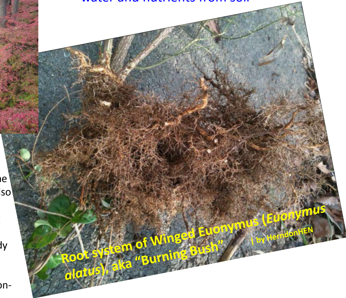
Root system of Winged Euonymus ( Euonymus alatus ), aka "Burning Bush"

Note how the fall color is muted in these plants that grew in the forest shade (as compared to the plants you see on roadsides). Many invasives also gain a competitive advantage by growing more each year because they leaf out earlier in Spring and continue to photosynthesize later in Fall. Certain wildflowers are able to grow in our shady forests only because they come up and flower before the trees leave out. Winged Euonymus, Japanese Barberry, and the hollow-stemmed, non-native Shrub Honeysuckles shade them out.