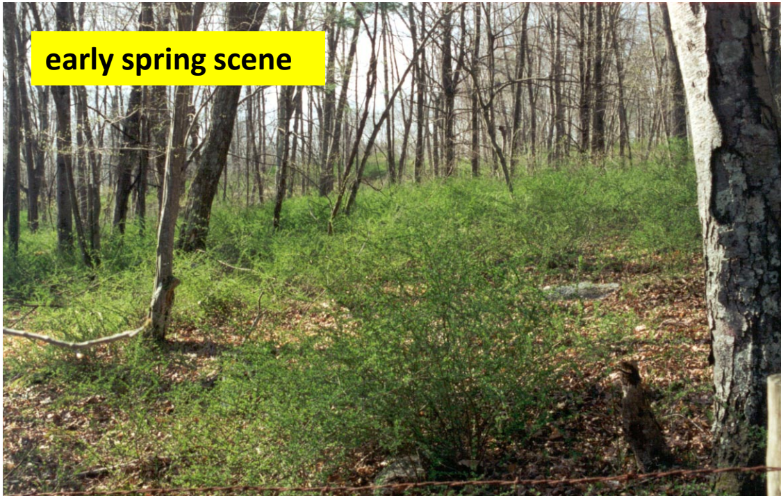
early spring scene