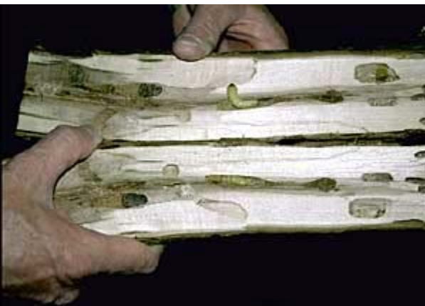
Larval tunnels disrupt sap flow near the bark which kills the tree – but trees can undergo a lot of internal structural damage first.

The larvae of Asian Longhorned Beetle (ALB) and Emerald Ash Borer (EAB) eat inside tree branches and trunks in the active part of the wood close to the bark where sap and water are transported. They go into the heartwood (internal structural part not involved in water or sap transport) to pupate.