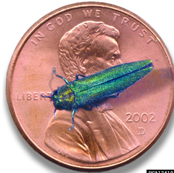
Emerald Ash Borer – is much smaller than ALB