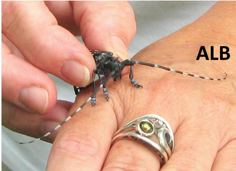
Asian Longhorned Beetle