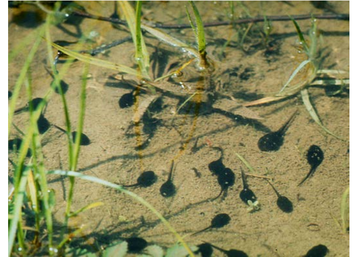
Frog tadpoles go hungry.

In waterbodies (not polluted by excess N & P) fewer nutrients is a problem.