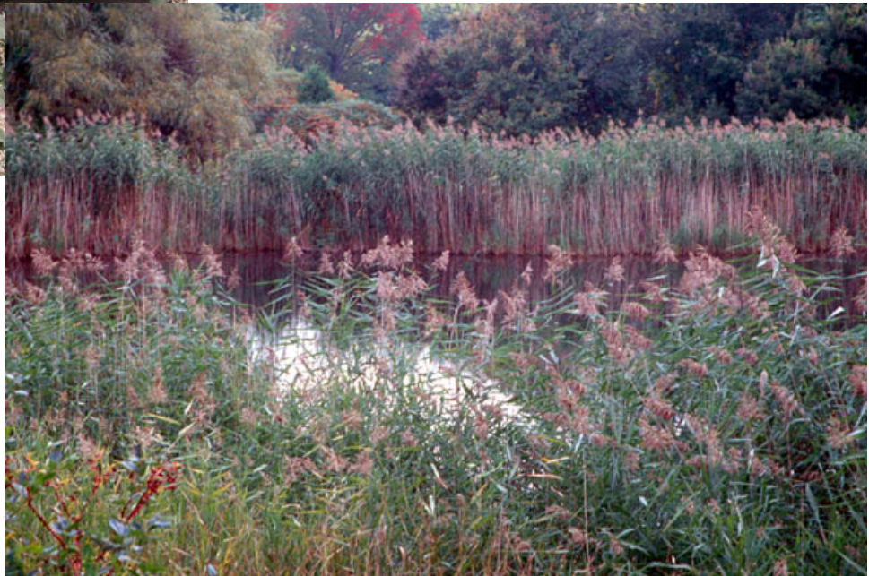
Phragmites – aka Common Reed