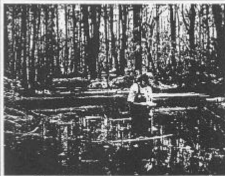
Fig. 1-2. Large pool with emergent vegetation. Many pools are over 10,000 sq. ft. in area and have sections over 4 ft. deep.

In Massachusetts, a vernal pool must be utilized by certain animal species to be an actual vernal pool under the Wetlands Protection Act. Vernal pools are unique as a wetland resource as they are the only type of wetland which is defined by its animal populations rather than its plant populations. Vernal pool animal species may be divided into two general groups, those which breed