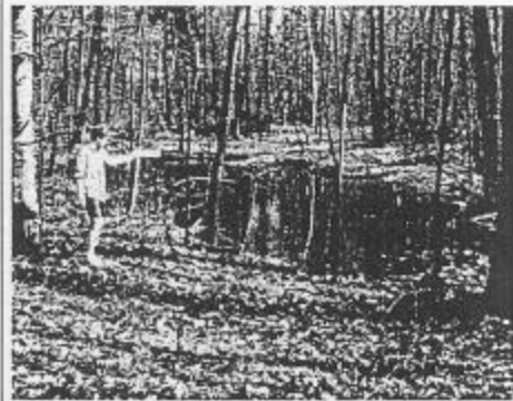
Fig. 1-1. Small vernal pool in wooded location. Some pools are less than 1000 sq. ft. in area and very shallow.

Vernal pools are separated from other bodies of water. They occupy a "contained basin depression" or low spot in the terrain which does not have a permanent outlet. It may overflow at times