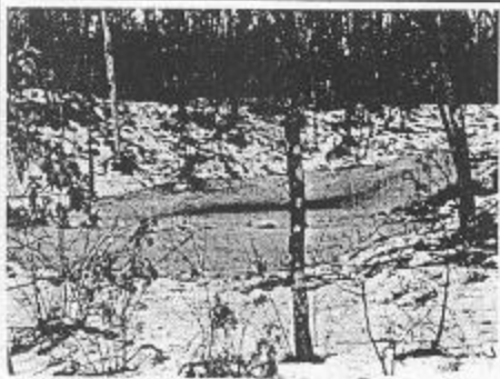
Fig.1-4. Vernal pool in winter. The combination of ice and open water makes the pool obvious from a distance.

Thus, we arrive at our definition of a vernal pool. A vernal pool is a contained basin depression, holding water for two to three months or more, which lacks breeding populations of fish and which supports the breeding of wood frogs or mole salamanders or contains fairy shrimp. You might certify or study a pool by the facultative routes (3-5) but they will not be addressed in depth in this pamphlet. Most information contained herein is directed towards a body of water which supports the obligate species.