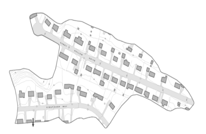
Figure 5. Control Watershed

For the Jordan Cove project, the treatment period will occur in two phases: (1) during construction of the traditional and BMP neighborhoods; and (2) after construction when the BMPs are in effect. The paired-watershed approach is being used to measure the differences in water quality and quantity between the treatment areas (traditional and BMP neighborhoods) and the control area (Figure 5), a nearby 10 year-old subdivision, caused by construction in the two treatment areas and the application of BMPs in the BMP neighborhood. Stormwater quality and quantity are measured at the outlets of each of the two treatment neighborhoods, and the control watershed. Water quality is measured by analyzing weekly flow-weighted composite samples for total suspended solids (TSS), total phosphorus (TP), total Kjeldahl nitrogen (TKN), ammonia nitrogen (NH<sub>2</sub>-N), and nitrate+nitrite nitrogen (NO<sub>3</sub>-N). Grab samples are analyzed for fecal coliform and BOD<sub>5</sub>. Monthly analyses are conducted for copper (Cu), lead (Pb), and zinc (Zn).