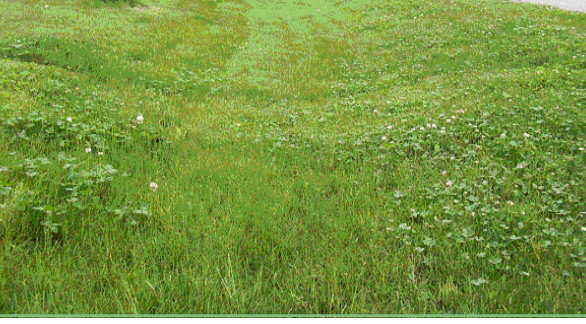
Figure 4. Swale