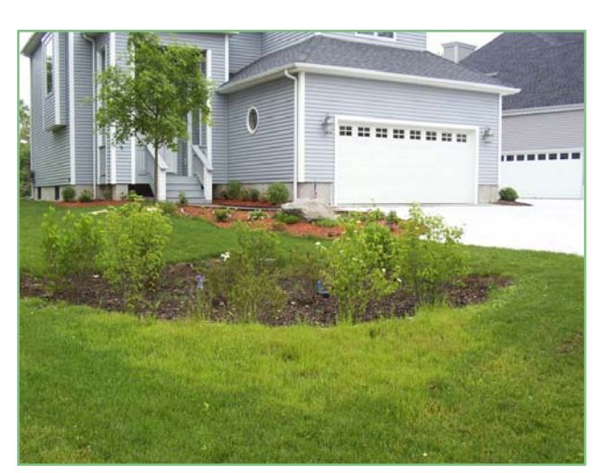
Figure 6. Rain Garden

The calibration period began in January 1996 to establish a baseline for future comparisons. Since the treatment period began in May 1998, runoff monitoring has focused on the effects of construction, and on the relative effectiveness of standard erosion and sediment control practices in the traditional neighborhood and enhanced controls in the BMP neighborhood. Post-construction monitoring began in July 2002 and will continue for three years.