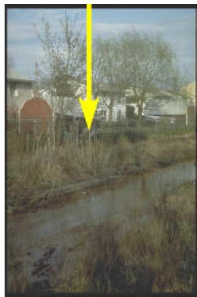
Poor Range (MD Save Our Streams) (arrow emphasizing lack of riparian zone)