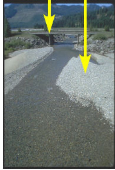
Poor Range (arrows emphasizing large-scale channel alterations)