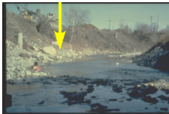
Poor Range (MD Save Our Streams) (arrow highlighting unstable streambanks)