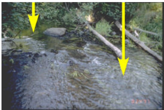
Optimal Range (Mary Kay Corazalla, U. of Minn.) (arrows emphasize different velocity/depth regimes)