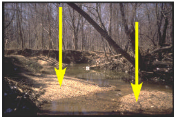
Poor Range (arrows pointing to sediment deposition)