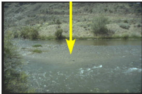
Poor Range (arrow pointing to sediment deposition)