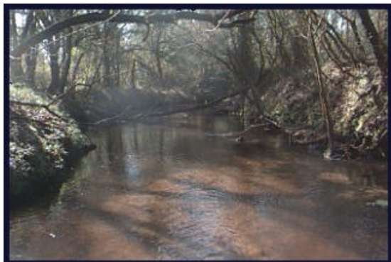
Optimal Range (Peggy Morgan, FL DEP)