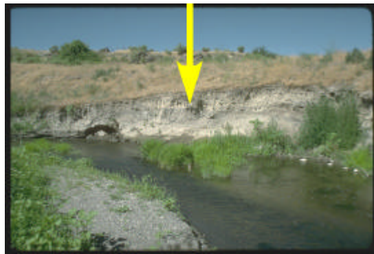
Poor Range (arrow highlighting unstable streambanks)