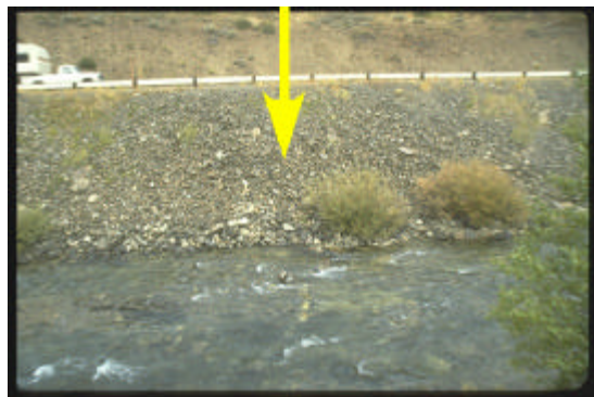
Poor Range (arrow pointing out lack of riparian zone)