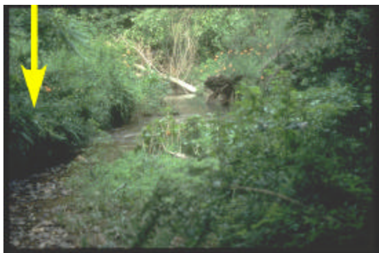
Optimal Range (arrow pointing to stable streambanks)