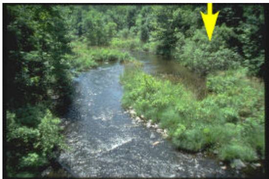
Optimal Range (arrow pointing out an undisturbed riparian zone)