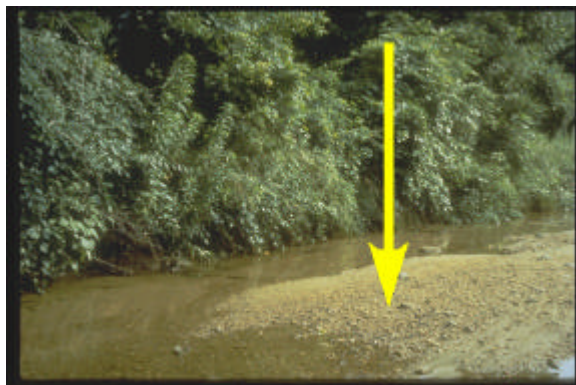
Poor Range (arrow showing that water is not reaching both banks; leaving much of channel uncovered)