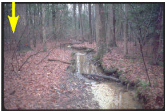
Optimal Range (arrow emphasizing an undisturbed riparian zone)